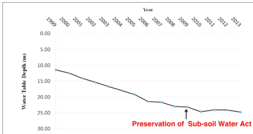
Figure 2: Decline in Groundwater table

per hectare of paddy compared with national average of 3.2 tons (2011-12). This has been achieved with highest use of chemical fertilizers and pesticides as indicated earlier in Table 2. The use of farm yard manure has fallen to the negligible level, which has depleted the organic content of the soil to a disquieting level reducing efficiency of nutrient uptake further and necessitating higher and higher use of chemical fertilizers to achieve the same level of output.